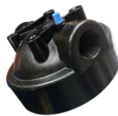
Housing cap with Pressure Relief Valve (PRV)

Does your water source suffer from contaminants, sediment, or odors? GWS filter housings are the first step in solving your drinking water needs. Built with the highest quality virgin materials and reinforced to withstand the highest pressures, our filter housings can be used with a wide assortment of cartridges and media for applications in homes, restaurants, industry, and anywhere clean drinking water is a must.