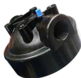
Housing cap with Pressure Relief Valve (PRV)

Does your water source suffer from contaminants, sediment, or odors? GWS filter housings are the first step in solving your drinking water needs. Built with the highest quality virgin materials and reinforced to withstand the highest pressures, our filter housings can be used with a wide assortment of cartridges and media for applications in homes, restaurants, industry, and anywhere clean drinking water is a must.