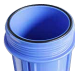
Single recess top mounted O-ring