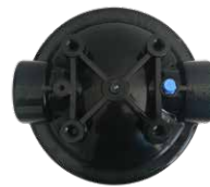
Housing cap mounting bolt hole design