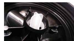
Removable filter cartridge centering plug