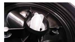
Removable filter cartridge centering plug