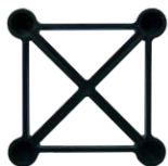
PRV protection plate for protection during shipping